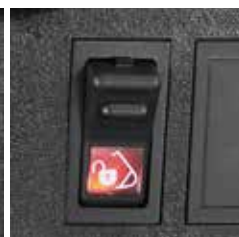
Safety Switch (Backhoe)