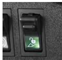
Safety Switch (Loader)